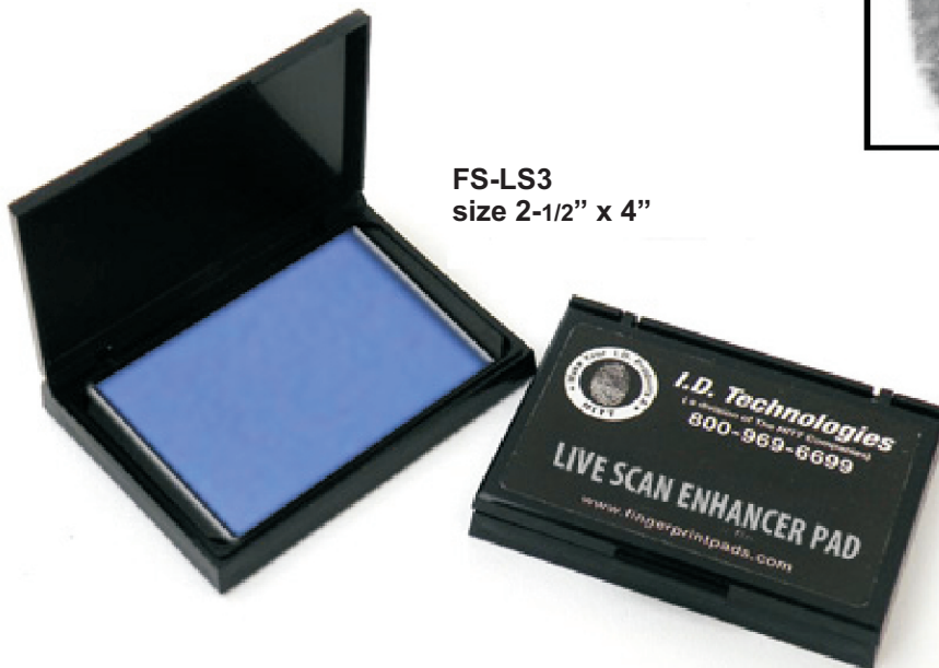
FS-LS3 size 2-1/2" x 4"