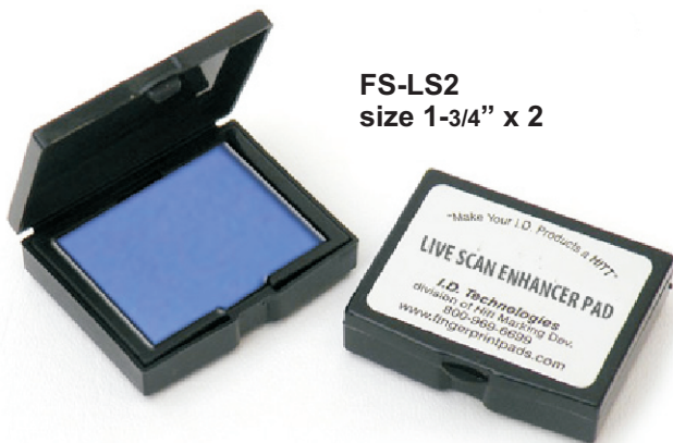
FS-LS2 size 1-3/4" x 2"

Available in two sizes: Our number FS-LS2 1-3/4"x2" and our number FS-LS3 2-1/2"x4".